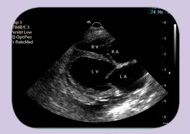
Echocardiogram from a cat in heart failure due to DCM