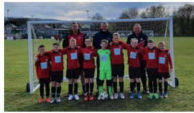
Haydon Bridge under 10's